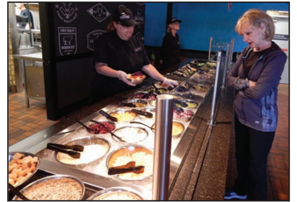
The salad bar features many fresh choices