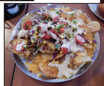
BBQ Brisket Nachos