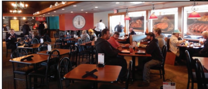
The updated interior